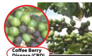
Coffee Berry Disease (CBD)

KEEP LOCKED OUT OF REACH OF CHILDREN (WEKA MBALI NA WATOTO)